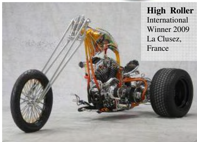
High Roller International Winner 2009 La Clusez, France

Fresh from their latest successes in France, where extreme trike High Roller , won the International prize at the recent Affiliate show in La