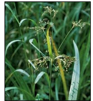
Above: Wood Club Rush

Scarborough road and no doubt some will notice the old corn mill at Kirby Mills. Not so many will have noticed the old mill weir and the mill goit on the River Dove with its working sluice gate are historic artifices and reminders of the clean water power of a by-gone era. The river is separated from the road by a small natural meadow which is still there because the builder of the weir had to own the land at either end of the weir. There is also a historic right of free fishing. A decade ago the weir collapsed during a heavy flood and all that remained was an unsightly ditch with a trickle of water in the bottom and a dried up mill goit. Local residents were dismayed at the thought that this historic site might never be restored but the local landowner and the Environment Agency contributed to the restoration. This small meadow previously had an abundance of wild flowers and a fringe of water plants, some of which were