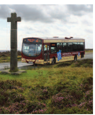
Moorsbus near Ralph Cross

tion and, most importantly, a feeling of belonging to something and that they matter to each other. "