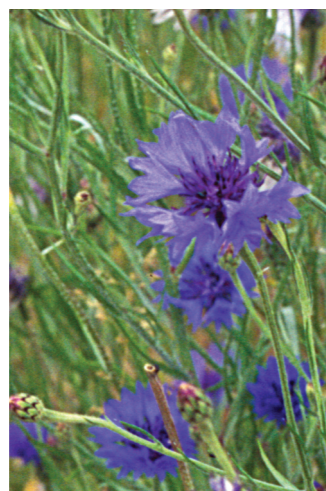
Cornflowers growing at the Pound

Ryedale Folk Museum, North York Moors National Park Authority and a group of volunteers set up the Cornfield Flowers Project. Over the years the project has identified sources of rare and declining wildflowers associated with arable production, taken seed, grown on plants and developed a wide partnership of farmers and volunteers to spread the plants around North Yorkshire.