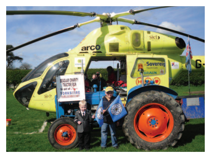
Ready, steady, GO! Last year's tractor race start