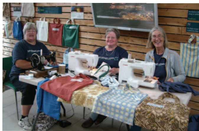
Making Morsbags at Dalby forest visitors centre

Morsbags groups known as “pods” can be found all over the world. The Kirkbymoorside Pod is very grateful that to have use of the house at St Chad’s Church for meetings. Since the group started almost 2000 bags have been made. Morsbags are made from recycled fabric and given away free, to be used instead of plastic carrier bags.