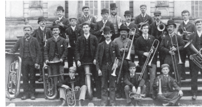
The earliest photo of Kirkby as a proper brass band, circa 1900

200 Years ago on the 10th of July 1815, twenty two days after the battle of Waterloo, the town of Kirkbymoorside purchased five instruments, a Serpent, two Bassoons, and two Horns for their band, to be the property of the inhabitants at large of the town of Kirkbymoorside. So for the next 200 years, the band, in all its forms, the town and people of Kirkbymoorside have been intrinsically linked.