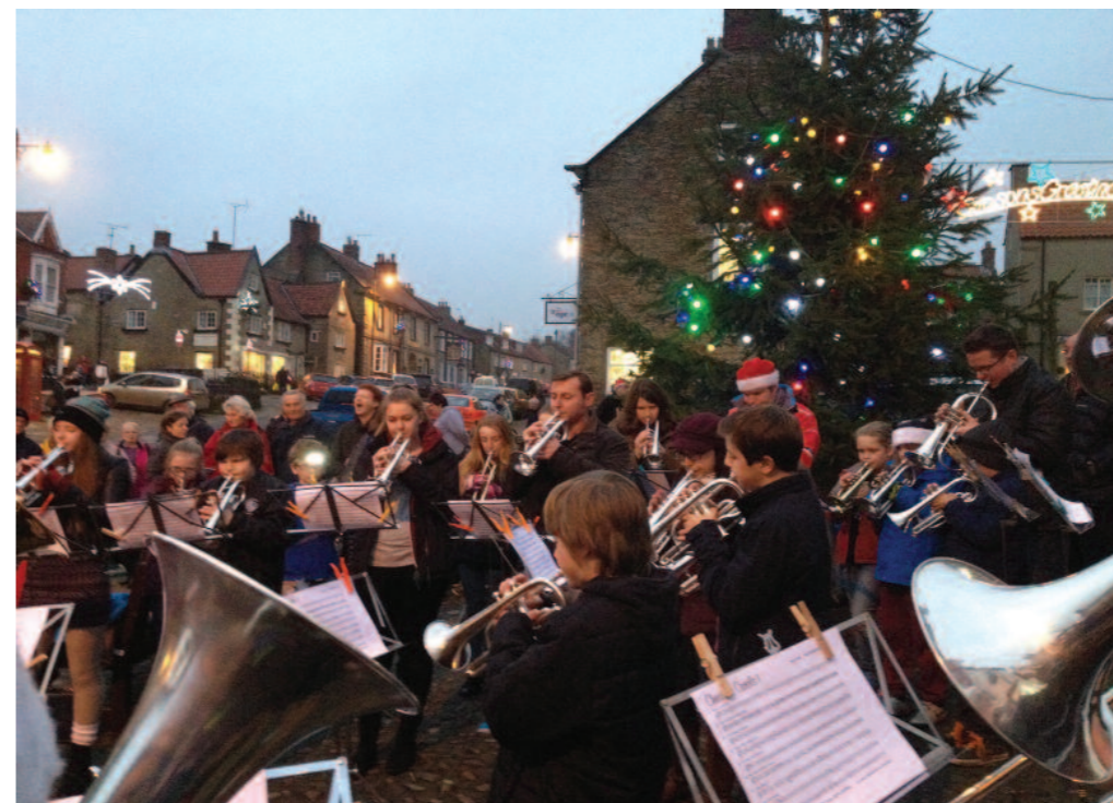
The Kirkbymoorside Band playing Christmas carols in the Market Place last year

This year the Christmas Market will be held on Saturday 28th November with over 30 food and craft stalls on the cobbles of the Market Place and in the Memorial Hall. In The Moorside Room there will be an exhibition by RJB Photographic entitled 'Northern Light'.