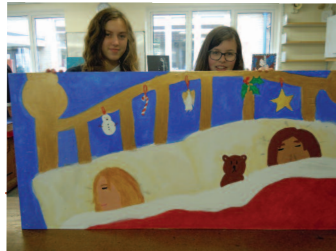
Students with their work for the Christmas Market boards

By invitation from Kirkbymoorside Town Council the students at Ryedale School have been working really hard